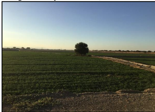
Pelegri Family Preserve (Old River)